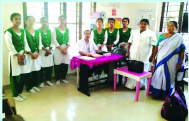
Health camp by GNM 1st Year