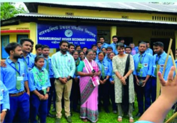
Field visit to Nahargurighat H.S School, Tetelia