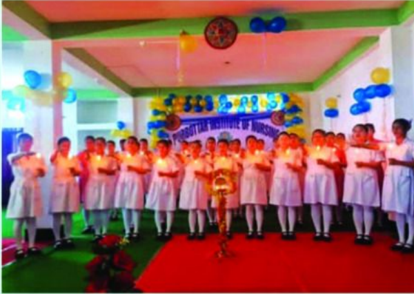
Lamp Lighting & Oath taking, PIN