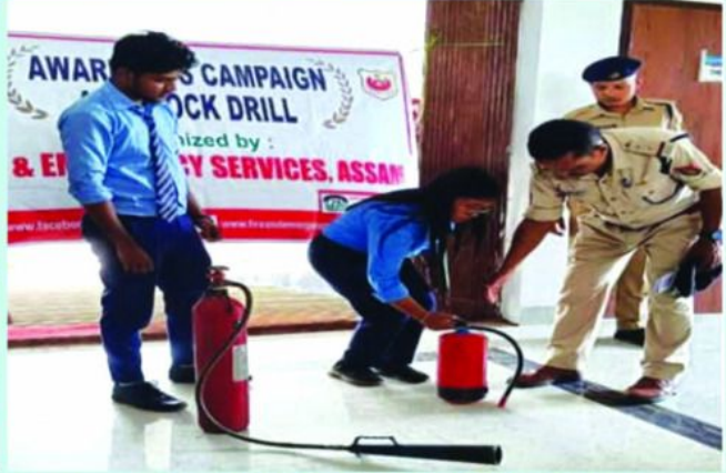
Awarness Campaign & Mock Drill by Fire & Emergency service, NCPS tetelia