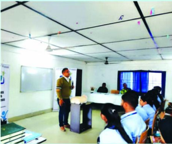
Health Awareness Drive DMLT