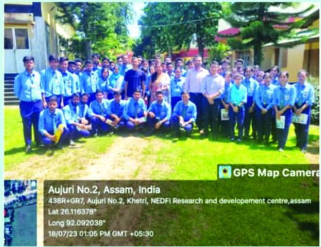
Field visit Medicinal Plant garden, NEDFI R&D center, Khetri, Assam